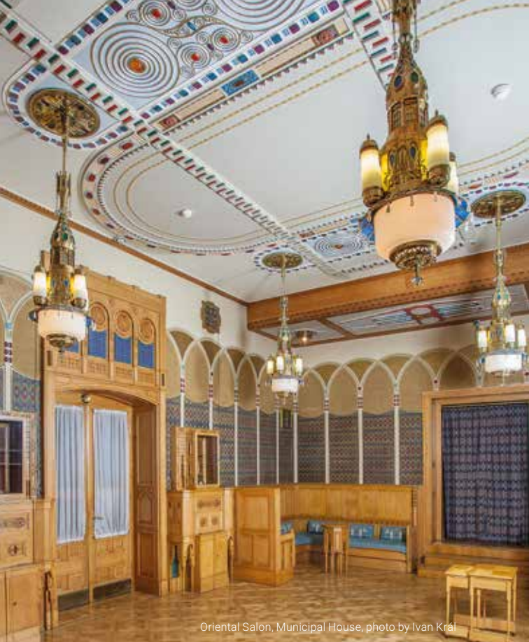
Oriental Salon, Municipal House