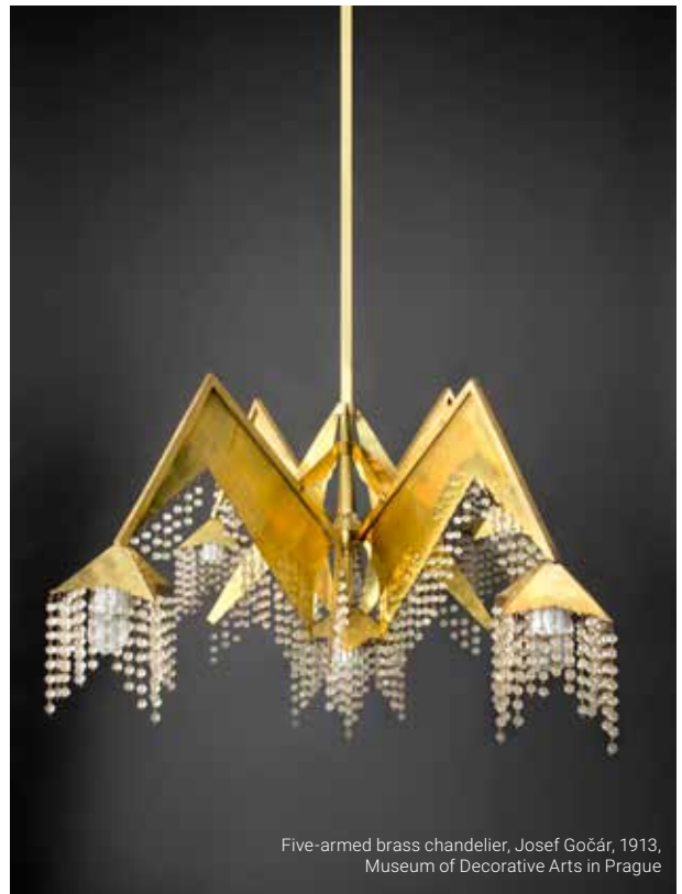
Five-armed brass chandelier, Josef Gočár, 1913, Museum of Decorative Arts in Prague

The long-term exhibition by the Museum of Decorative Arts in the landmark House at the Black Madonna provides a cross-section of works by early 20th century Czech architects and artists who took the principles of Cubism beyond visual art – to architecture and applied arts, namely ceramics, furniture, lighting, and more. (Don't forget to take a photo of the stunning staircase.) You can conclude the visit with a coffee and pastry at the Cubist-style Grand Café Orient on the second floor, or acquire a Cubist artifact or two in the Kubista store downstairs.